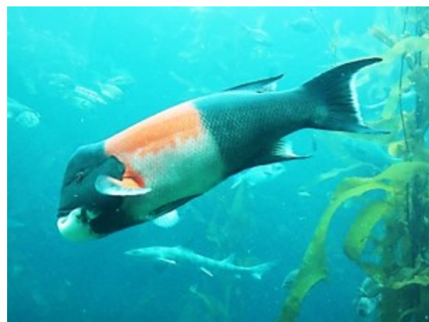
Image of Kelp Tank with California Sheephead and Shark at Monterey Bay Aquarium.

Education is the central mission of the Aquarium which primarily focuses on the local marine population. For example, interpretive signs teach that the Sheephead is a unique fish which morphs from female to male during the course of its life. Other postings dispel misconceptions about the shark fostered by trendy films and literature.