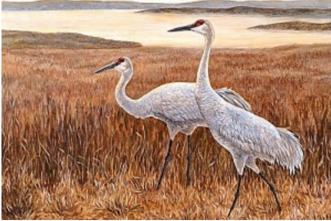
Sandhill Cranes by Rebecca Jabs, courtest of the artist, a student in the CSU Monterey Bay Sceince Illustration Program

Education and engagement of youth are vital goals of the local schools and Aquarium programming. One of the areas they study is the significance of shore birds to the overall healthy interrelationship of Ocean creatures.