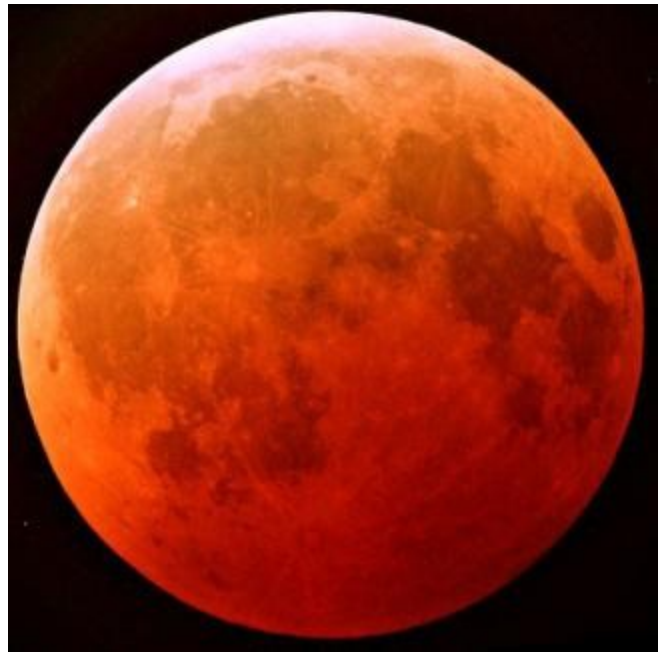
1Photo of the Moon

While paying close attention to what is happening to the sun, moon and earth may heighten our 'emotional sensitivities', I suspect spring tides, new moons, equinoxes are probably not required to effect this change.