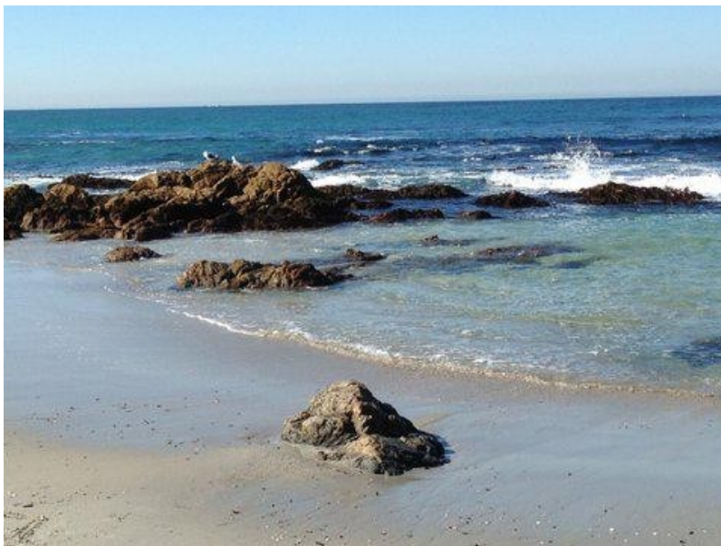
of high tide at Asilomar Beach, Pacific Grove, California.

It has also struck me that although western contemporary pagans often see the moon as female, mythologically the sun and moon carry a variety of meanings and can be male or female depending on the historical period and the culture. Perhaps in the future acceptance of the androgynous nature of humanity will ultimately settle these contradictions.