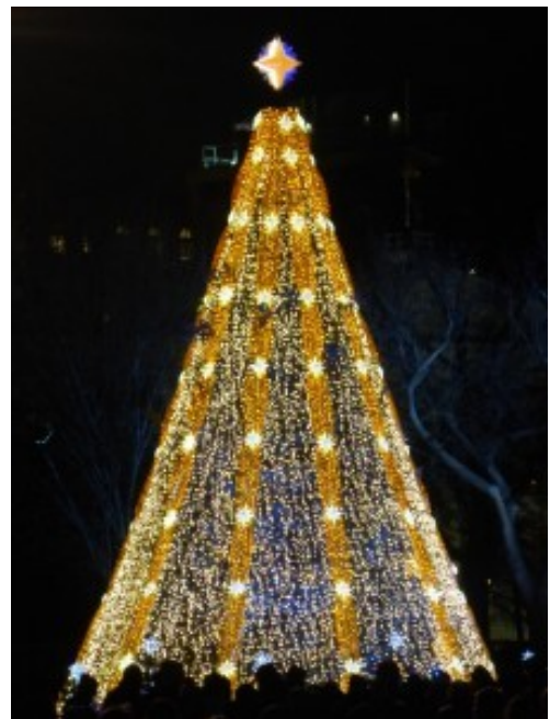
National Christmas Tree Lighting

The lighting of the National Christmas Tree on December 3 rd was especially relevant to this concern about the relationship of social conscience and Joy. But first, a little background.