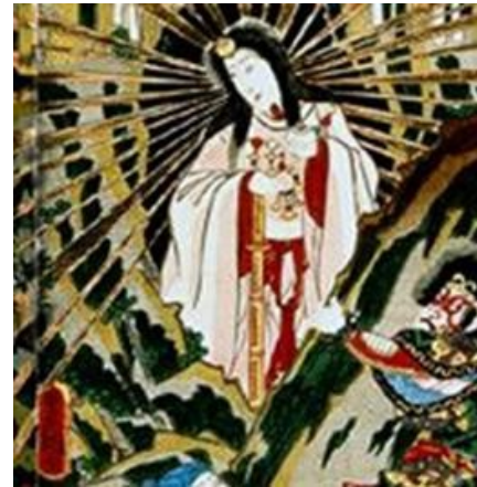
Japanese Sun Goddess Amaterasu and Shinto deities. This work is in the public domain.

Reviewing a cross-cultural drama, the story of Amaterasu, the Goddess of the Sun in Shinto, can provide insights about how to proceed. It speaks to this current occasion in our collective and personal lives when we are transitioning to unknown and potentially disruptive circumstances. It is also about when to withdraw and when to emerge.