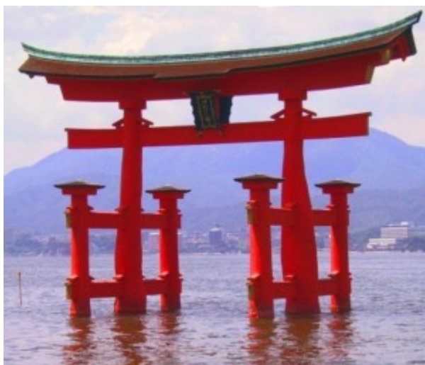
Torii Arch.

Shinto, centered in Japan, is one of the most prominent Earth-centered spiritual perspectives in the world. Kami are the Spirits or phenomena that are venerated in the religion of Shinto. They can be elements of the landscape, forces of Nature, as well as beings and the qualities that these beings express. Amaterasu is a major kami. This red Torii arch is a gateway that signals the transition from the profane to the sacred and is a prolific symbol within Shinto.