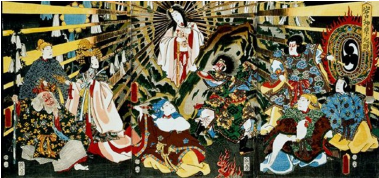
Japanese Sun Goddess Amaterasu and Shinto deities. This work is in the public domain

The story is complex and there are several versions with various levels of detail. Here are the highlights. Amaterasu is the Sun who brings all life to the Earth. In Her studio, many women weave the fabric of the natural world. Her brother, who is prone to jealousy and cruelty, is abusive to these women. Amaterasu becomes angry and withdraws into the Cave of Heaven, pulling the great door behind Her, sealing off the cave. When She withdraws she takes with her the warmth and light that has brought the goodness of life to the Earth. No longer was there day and night. No longer does the golden light help the rice to grow. Life is impossible. So, many Shinto goddesses and gods put their heads together and decide they will do a wild dance in front of the cave to try to draw Amaterasu out.