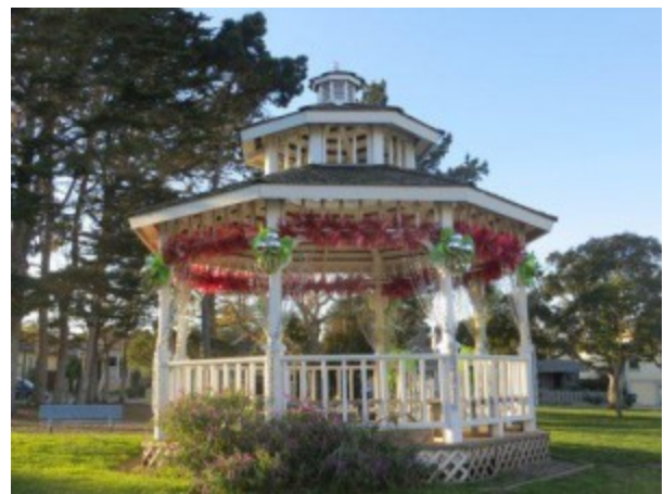
Pacific Grove California, Centennial Bandstand Gazebo and Faery House.

By coincidence, in the City of Pacific Grove in California where I live there is a place called Jewell Park in the center of town which is the home of a stand of trees and its own gazebo. I decided to make a pilgrimage to this park in honor of the return of the Sun, and my transcontinental connection with my friends.